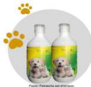
PAEAN Patrasche pet shampoo

IHC GROUP - PAEAN NATURAL DETERGENT, INC. Republic of KOREA